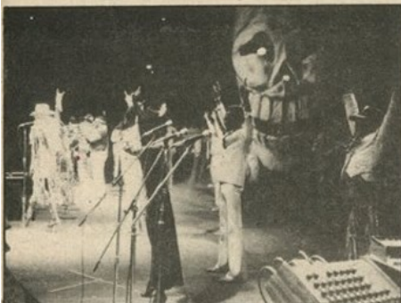
This is the place where the funk happens, and if you're not ready for it, you better spend a couple of weeks at Boot camp.