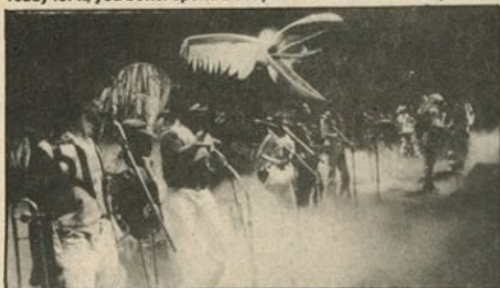
The latest move from Bootsy is Wipe Out Music, and it does just that on his new album.