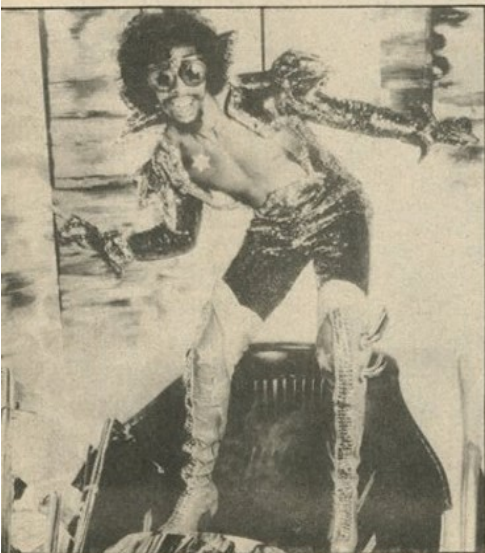
If you let him, there's no question he's going to funk all over you.