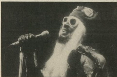
George and Bootsy have taken the rhythm and turned it into gold.