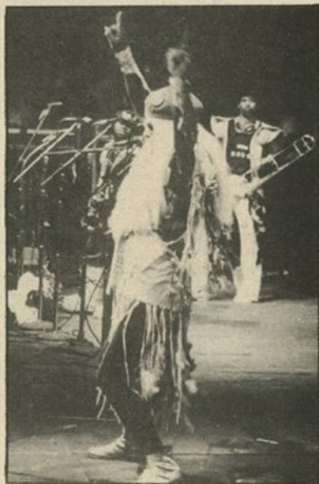
Bootsy's pal George Clinton gives the high sign to all P-Funk fans.